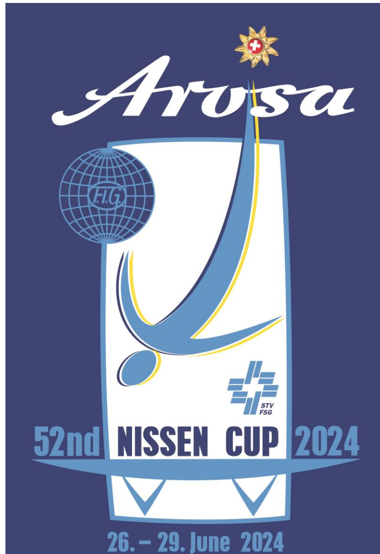
FIG Event ID: 17673